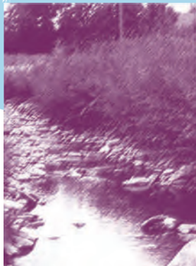
ERNST CONSERVATION SEEDS