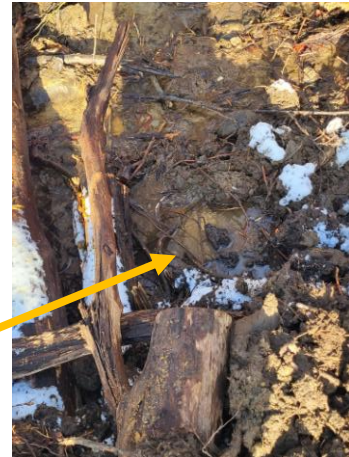
Stream water exiting corduroy

My inspection today of the work done so far indicated that no live trees had been cut, as no fresh-cut tree stumps were seen anywhere in the areas mowed. A small excavator appears to have been used to move downed logs around, and some of these downed logs appear to have been cut to shorted lengths to allow for them to be moved and stacked. All shrub stumps have been cut close to grade level, as well as fallen up-rooted tree stumps have been cut near the root flare of the trunk. No stumps appear to have been removed and stacked or buried.