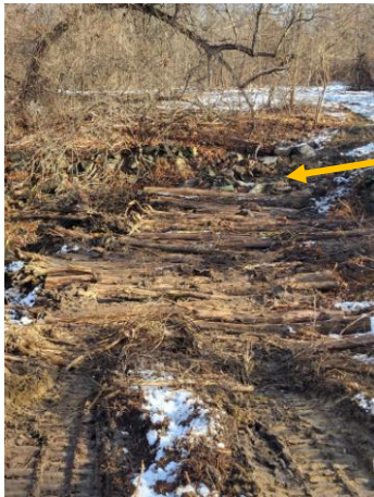
Enhanced corduroy crossing